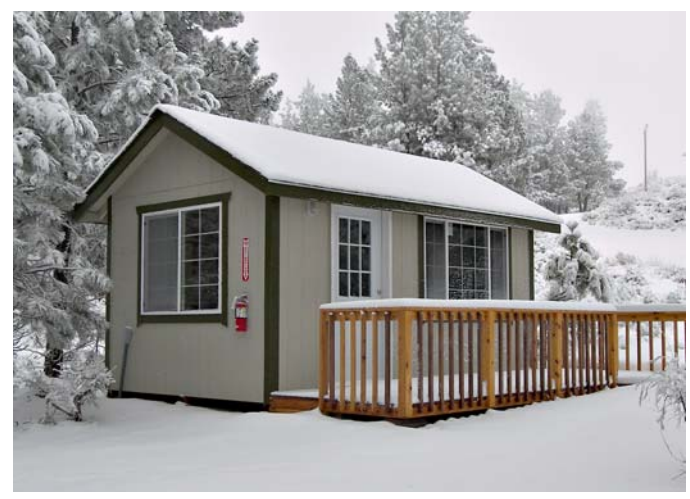
The Greeting Center before the winter snows melted.