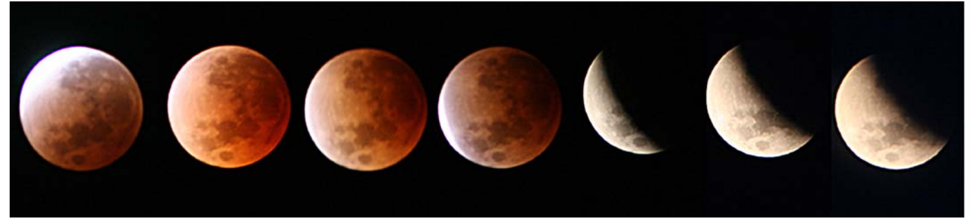
On February 20, 2008 the Full Moon rose while in eclipse. Dave Hill captured these images with his digital camera.