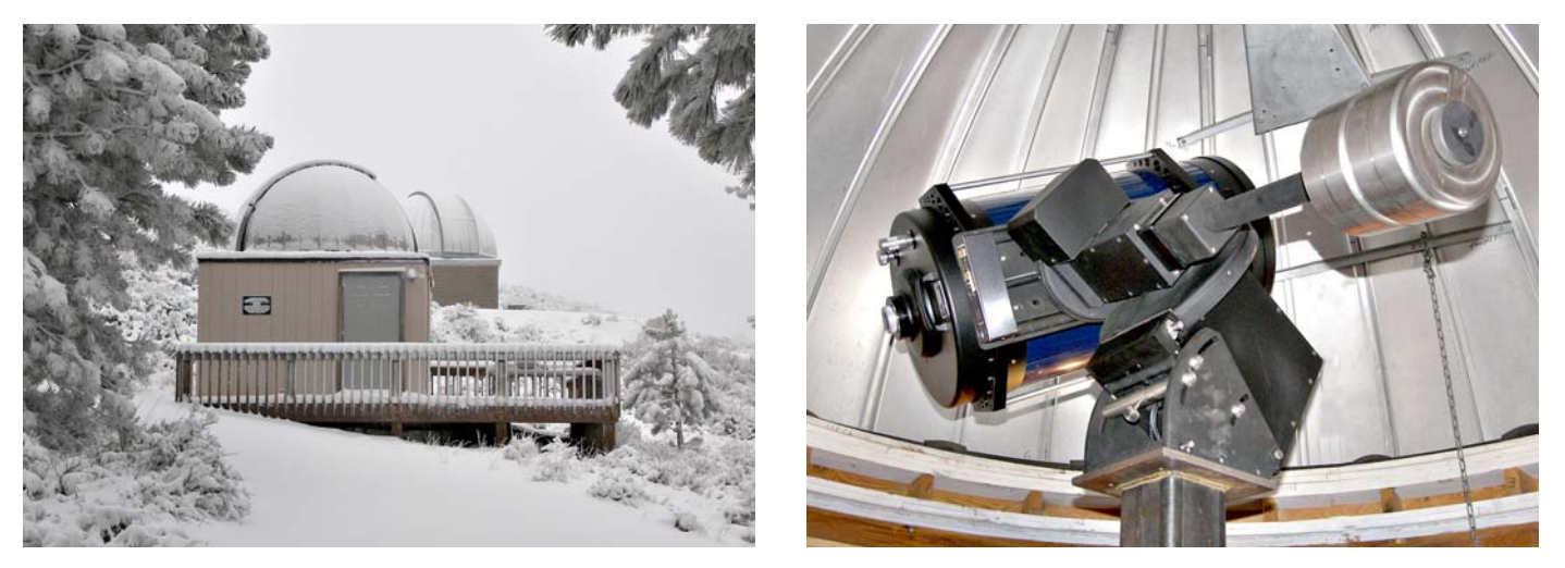
The new X15 imaging system is housed in the building and dome that formerly housed the 15-inch telescope.

telescope high enough to reach the horizon around a full 360 degrees. The computer-controlled mount will be able to point the telescope anywhere in the sky.